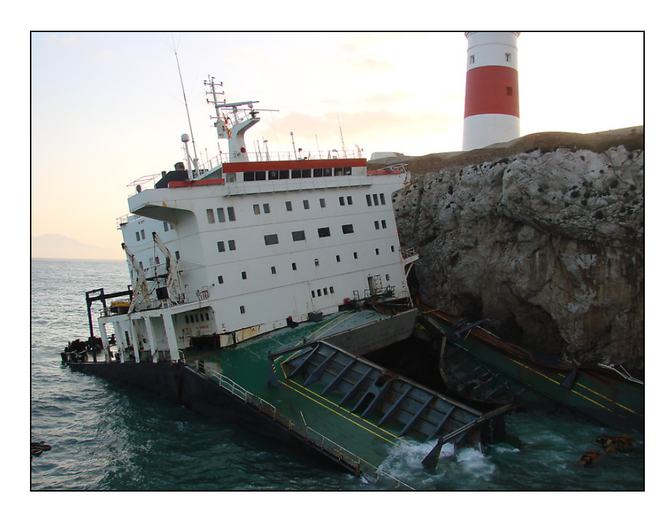
Figure 9: FEDRA at the foot of Europa Point.