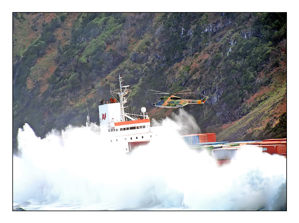
Figure 4: Removal of DG Cargo by Helicopter.