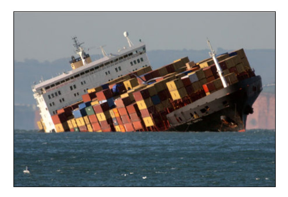
Figure 6: MSC NAPOLI beached in Lyme Bay.