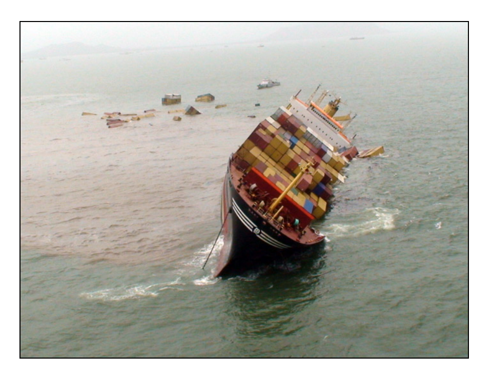
Figure 10: MSC CHITRA Prior to wreck removal.