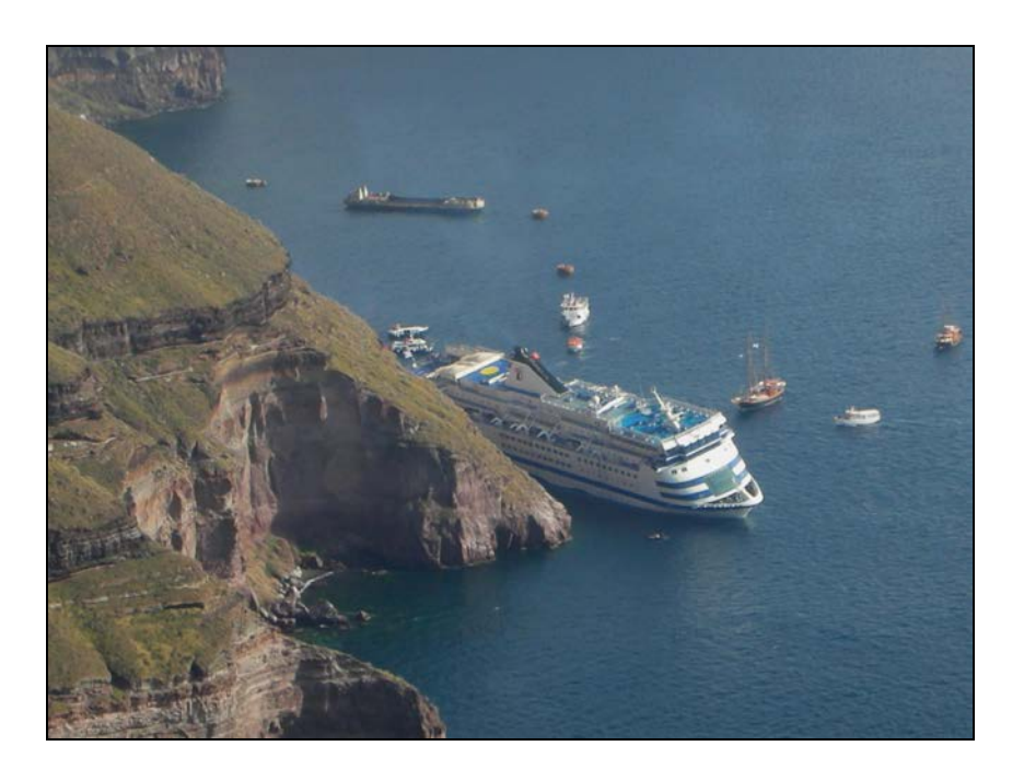
Figure 8: SEA DIAMOND prior to beaching/capsizing.