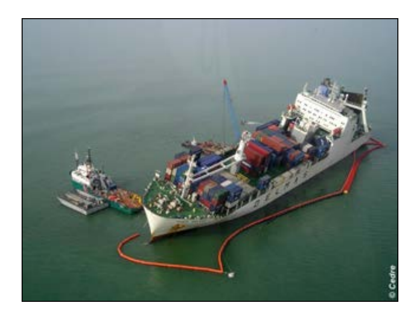
Figure 5: Removal of hydrocarbons.