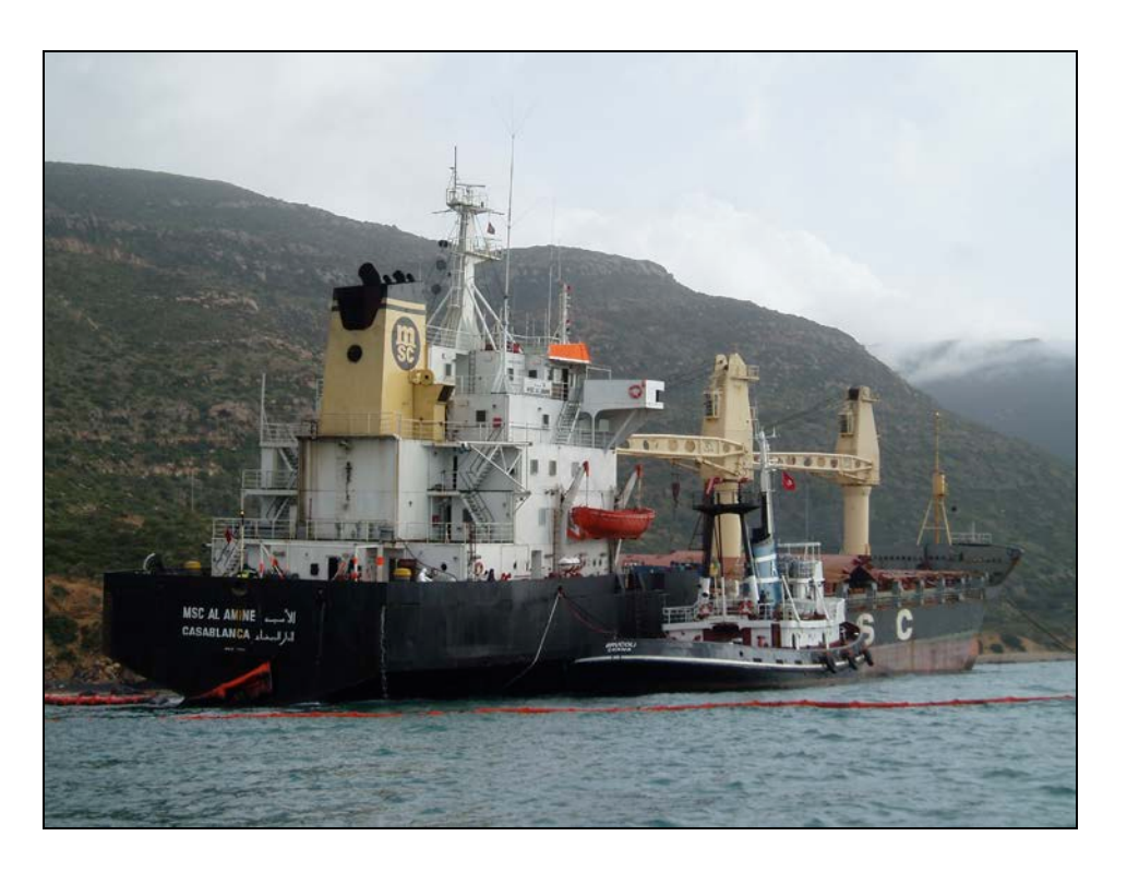
Figure 11: MSC AL AMINE Aground at Qurbus.