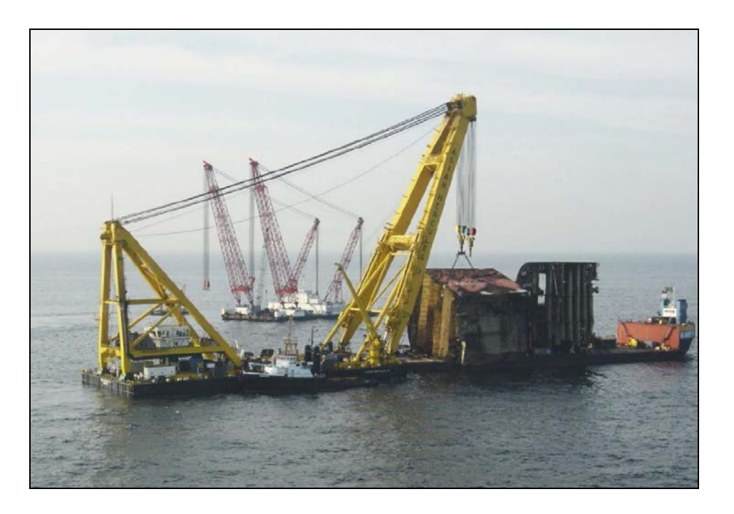
Figure 3: Successful lift of second wreck section.